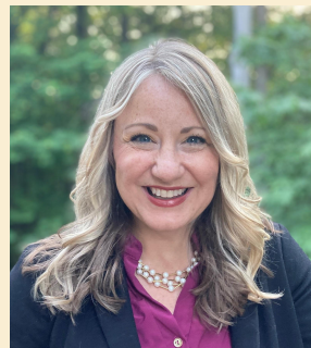
Mjere Simantel Social Services