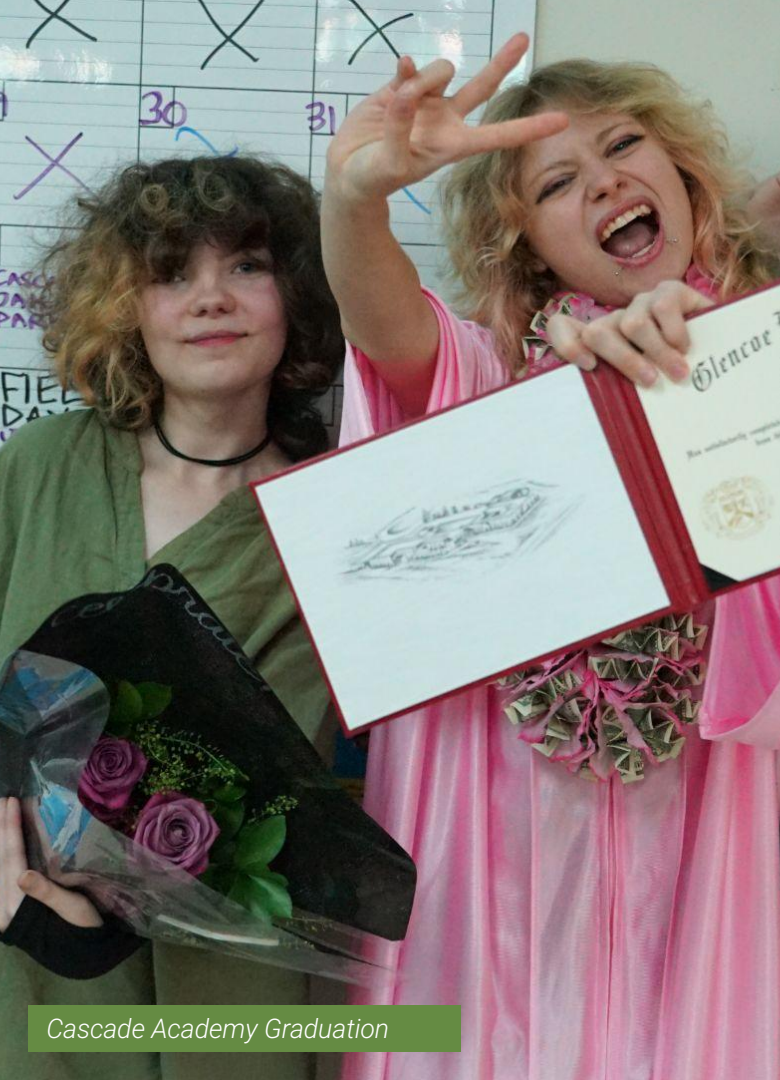
Cascade Academy Graduation