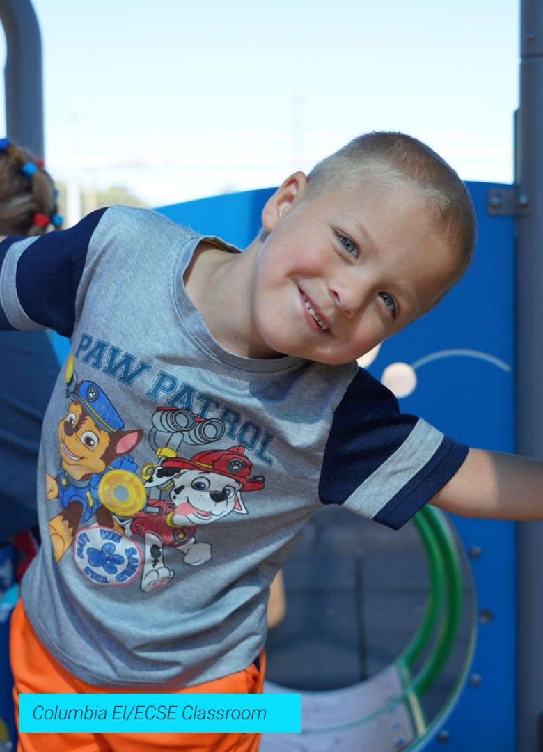
Columbia EI/ECSE Classroom