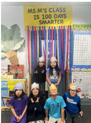
Second and third graders