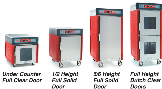
Under Counter Full Clear Door