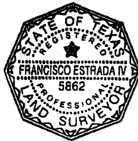
EXHIBIT "B" Page 2 of 2