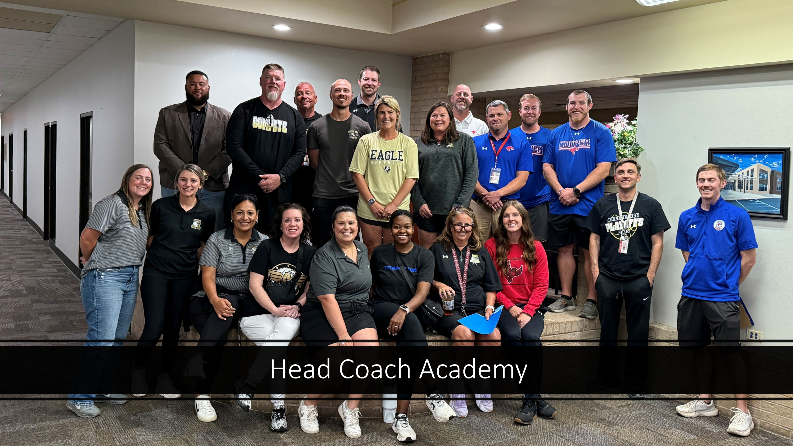
Head Coach Academy