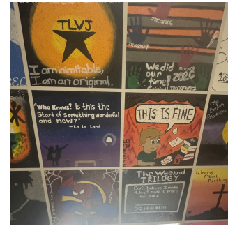
Tiles in the 200 Hallway