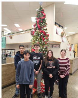
Pre-Area Choir Auditions