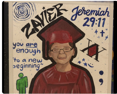
Self Portrait Tile