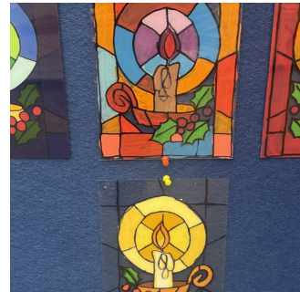
Stained Glass Creations