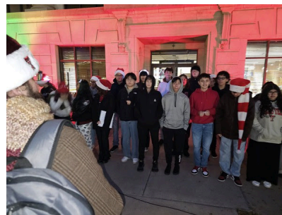
Caroling at the Christmas Parade