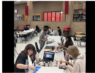
Saturday Morning Fun