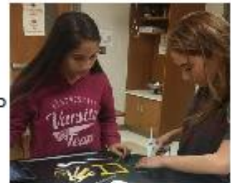
IPC students build catapults.

Chemistry students explored properties of Oobleck. They worked collaboratively and had to think critically to understand this weird non-Newton solid