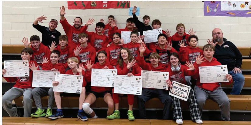
MacArthur wrestlers celebrate their winning streak and perfect record.

MacArthur is following the nationwide trend of a huge increase in the number of girls joining wrestling teams, from middle school through college. In fact, girls wrestling is the fastest-growing high school sport in Illinois, according to the IHSA (Illinois High School Association).