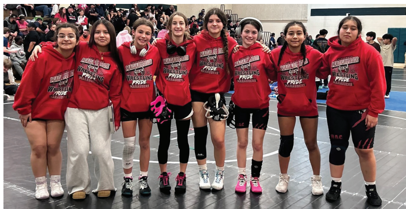
MacArthur's program has benefited from the growth of girls wrestling, with 15 girls joining the team this year and contributing to the historic season.