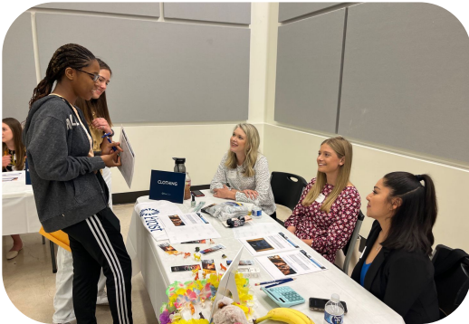
College & Career Awareness Needs