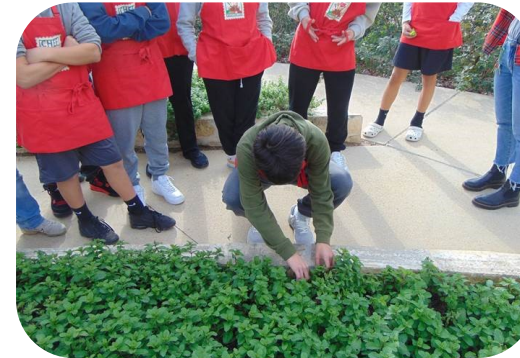
Attendance & Engagement Needs