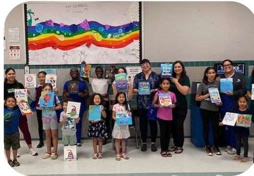
Family Engagement Needs