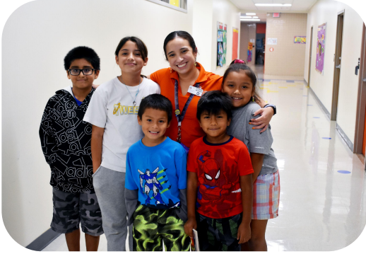
Mental & Behavioral Health Needs