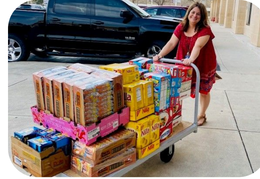
Social Service Needs