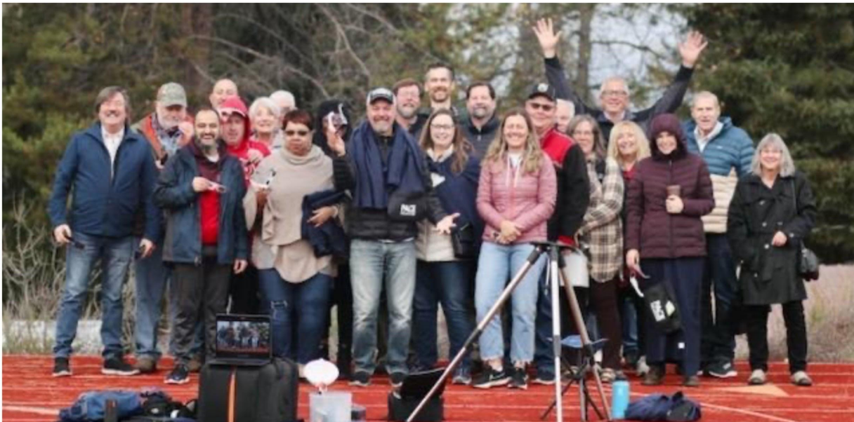
Top and bottom collages- these pictures show our excursion to Gilchrest Oregon for the annular eclipse activity.