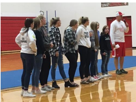
HHS Sources of Strength Webpage