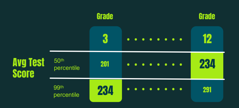
Spring Maths Achievement Percentiles, IXL Test | Appendix 1.A