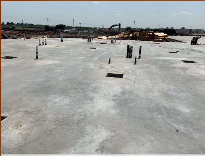
SLAB INSTALLED - AREA A