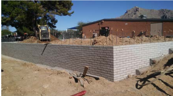
New Classroom Foundation

Restroom renovations are complete in the “B” Building, are in process in the “D” Building, and will be progressing across campus during the spring semester.