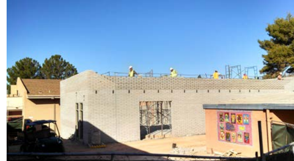
New Classroom Exterior CMU Walls