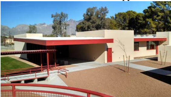
Exterior Entry Elevation

Phase 3 of the project, renovation of classrooms in the west wing into intervention rooms and installation of a shade canopy where the old west portable was is in process.