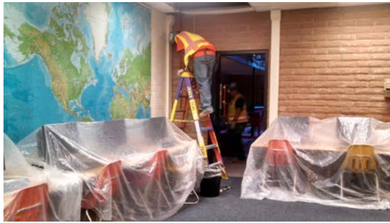
Night Crew Classroom Cabling