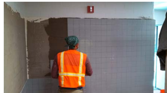
D Bldg. Restroom Renovation (setting tile)

The Harelson Project is on schedule and on budget.