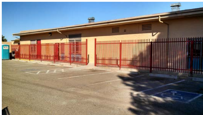
Campus Security Fence Installation Has Started

The Cross project is on schedule and on budget.