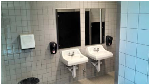
Completed 200 Wing Restrooms