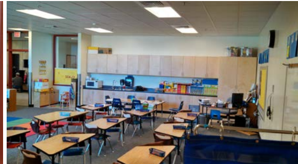
1 of 4 New Typical Classrooms