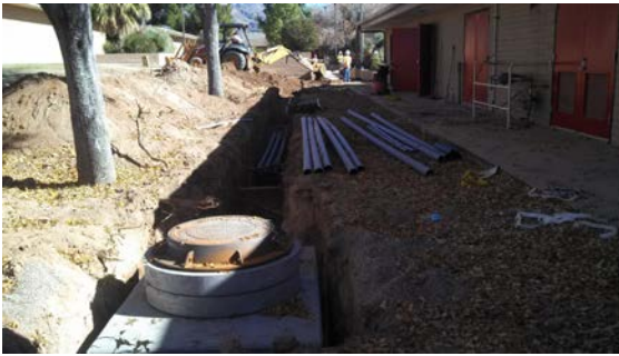
Campus Re-cabling Underground Conduit and Vault Installation