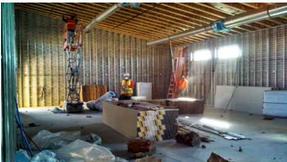
Auxiliary Gym Insulation and Drywall