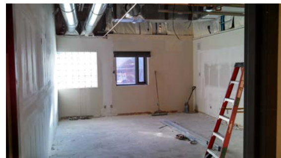
West Wing Intervention Room(s) Remodel