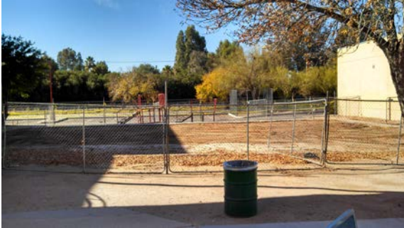
Area Where West Portable Use To Be (removed during winter break)