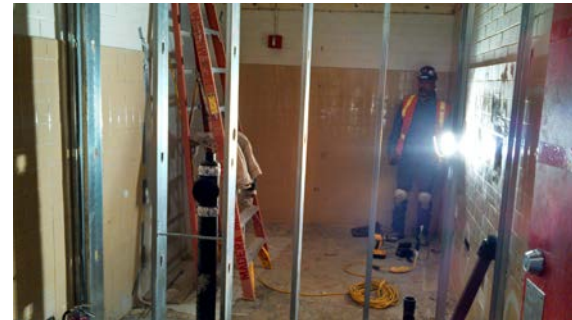
500 Wing Restroom Renovation in Process