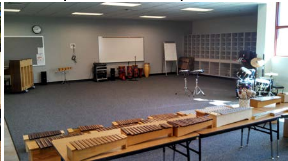
New Music Room