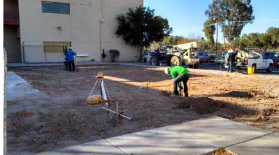
Foundation Prep for Shade Canopy

The Rio Vista project is approximately four weeks ahead of schedule and under budget.