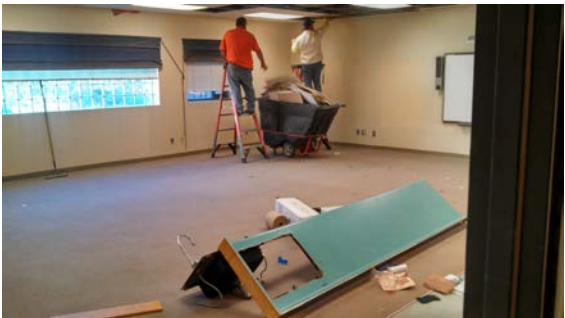
West Wing Demolition for Intervention Room(s) Remodel