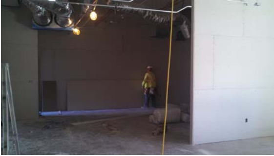
500 Wing Drywall Installation