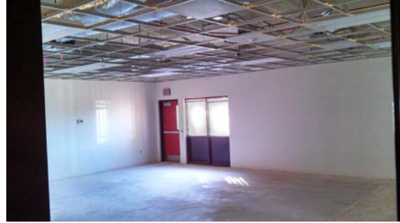
500 Wing Ready for Carpet and Ceiling Tile