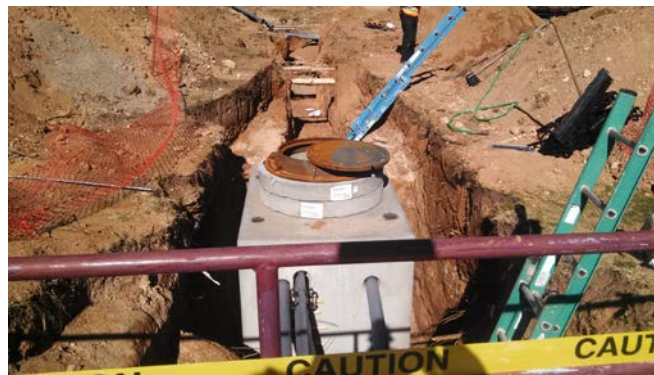
Campus Re-cabling Underground Conduit and Vault Installation