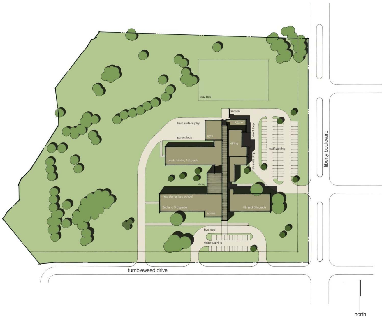
overall site plan