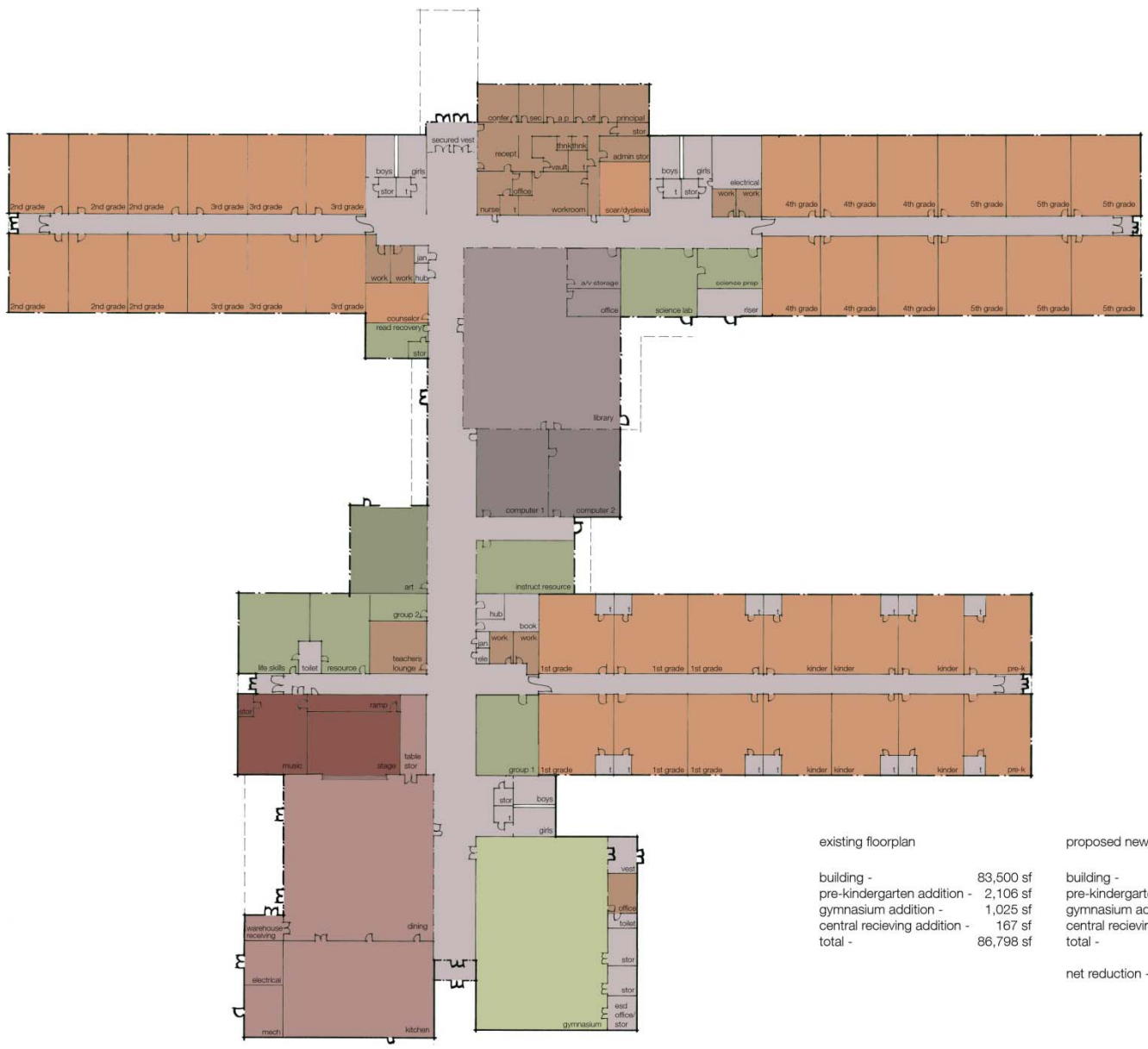
overall floor plan