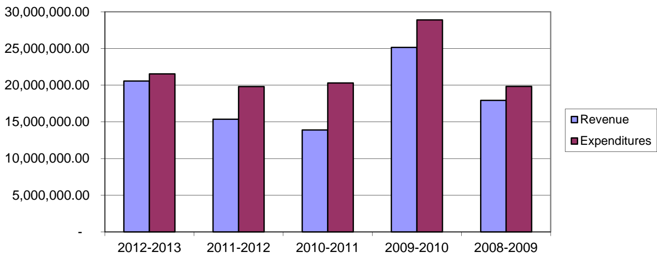
General Fund YTD Revenues & Expenditures