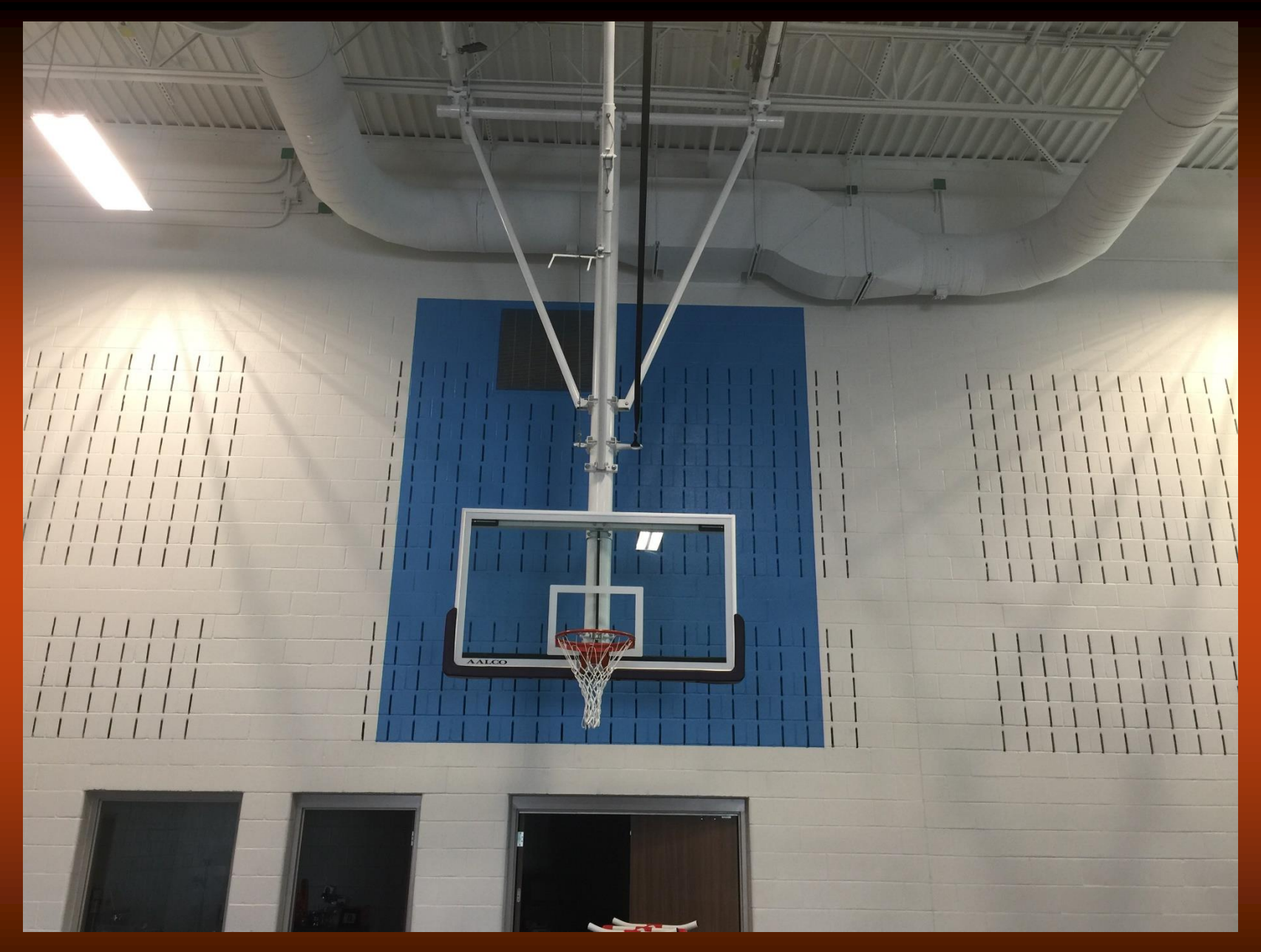
Walsh Elementary Basketball Goals