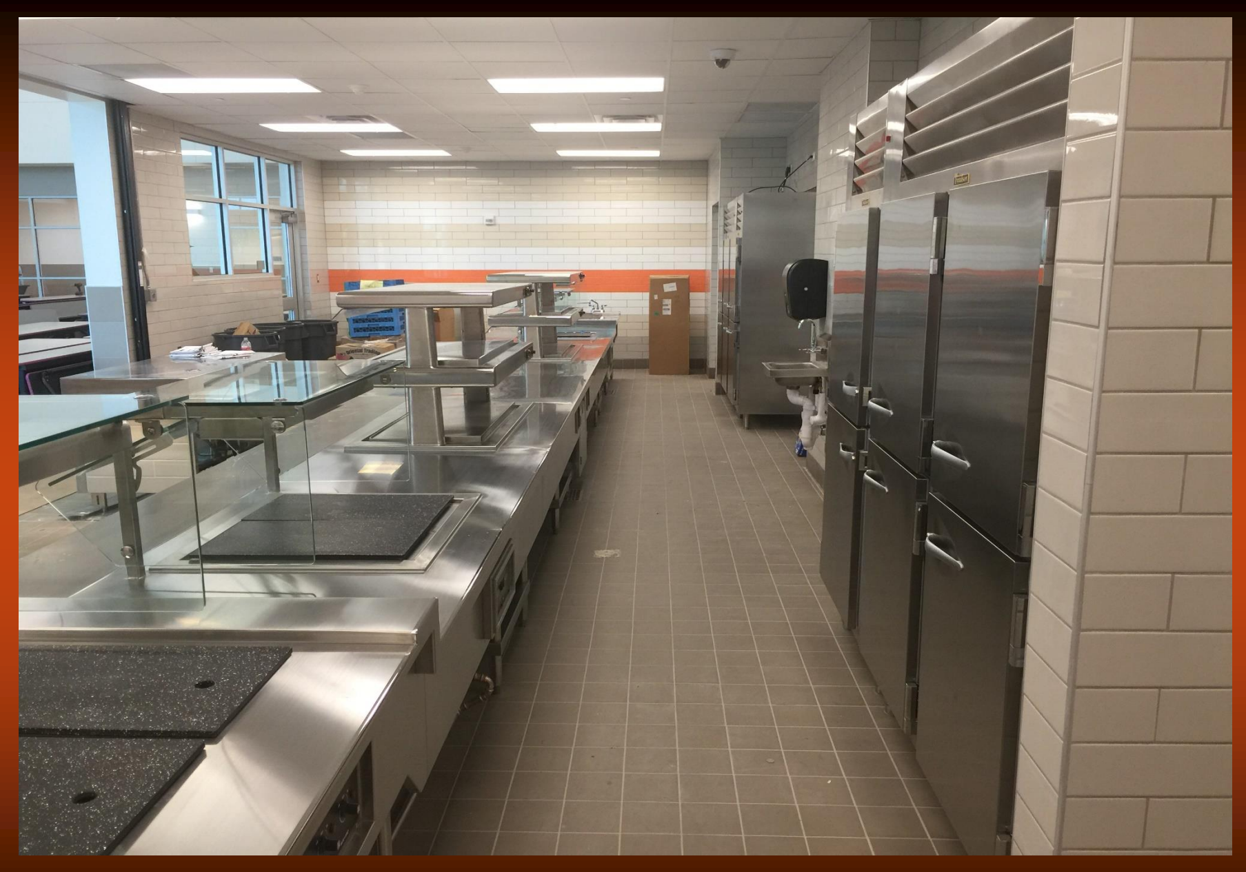
Walsh Elementary Kitchen Serving Line