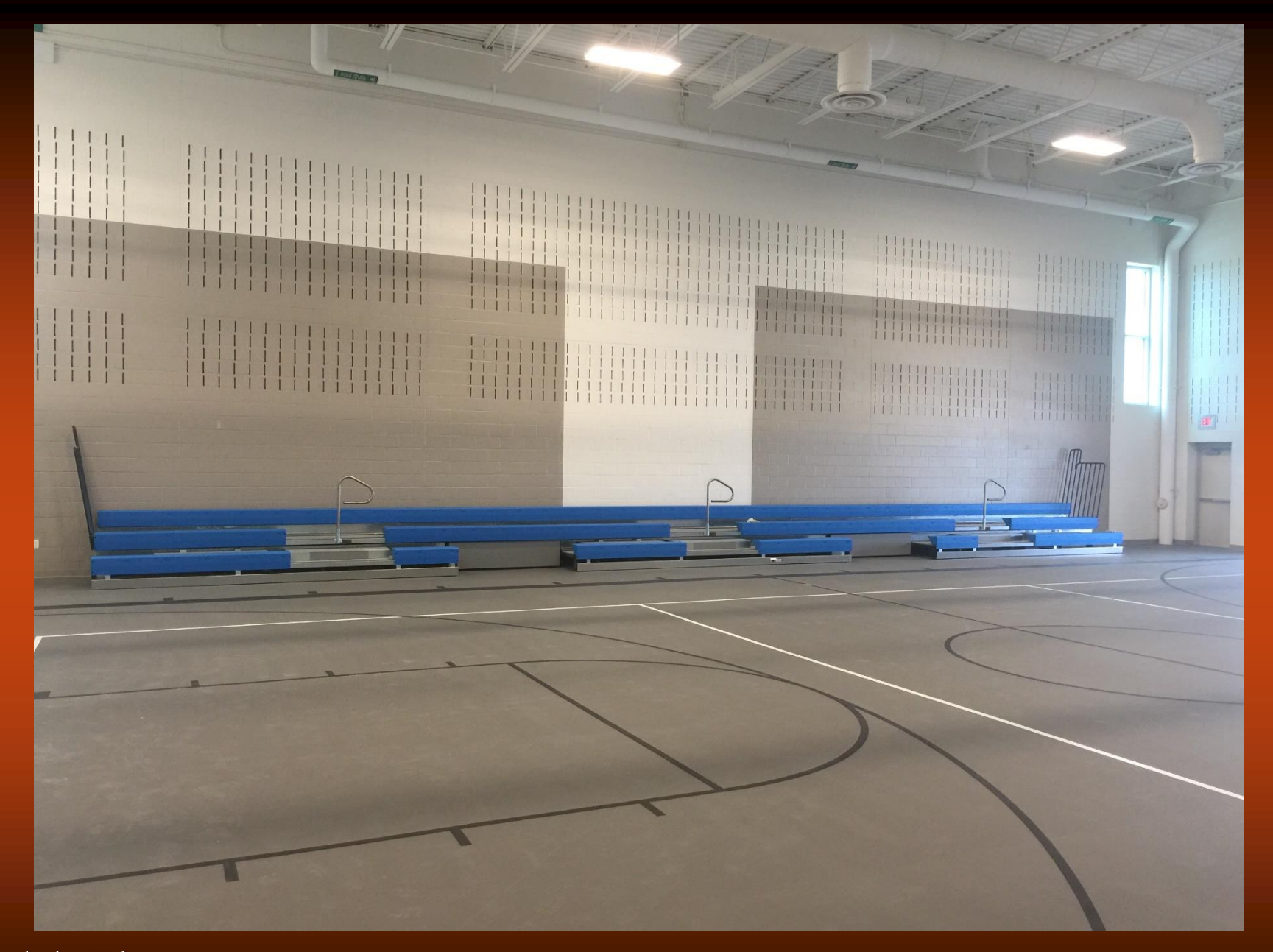
Walsh Elementary Gymnasium Bleachers