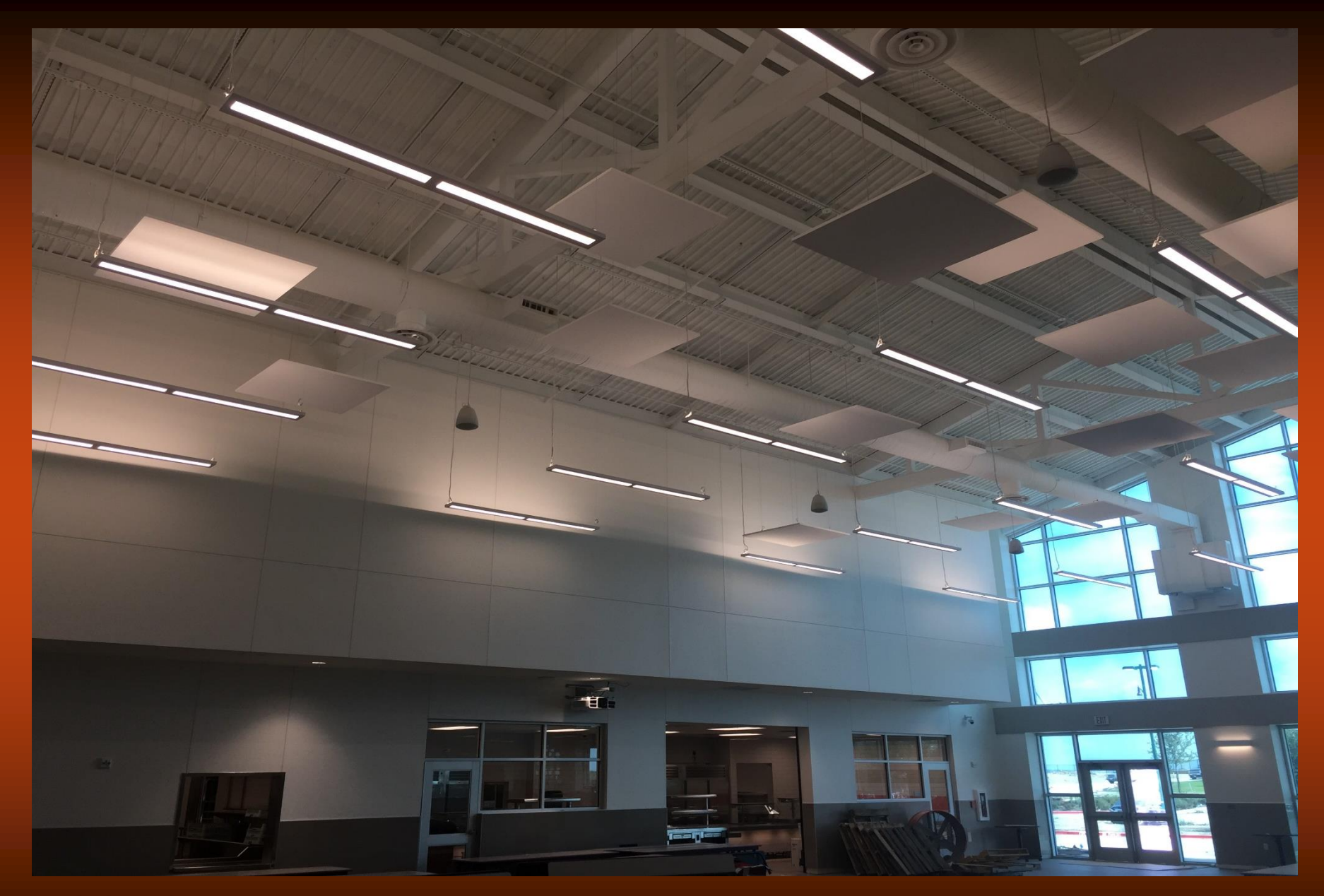
Walsh Elementary Cafeteria and Ceiling