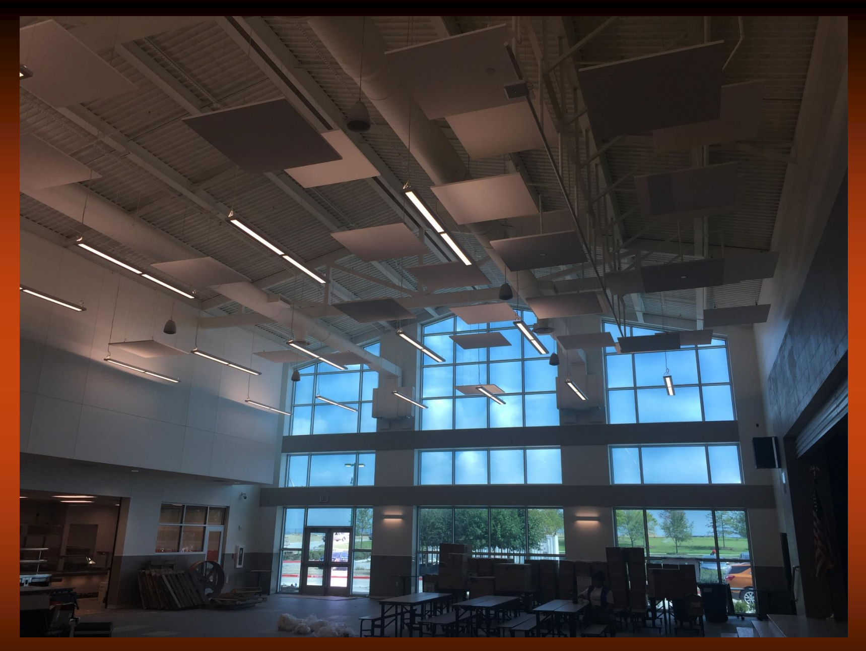
Walsh Elementary Cafeteria and Ceiling