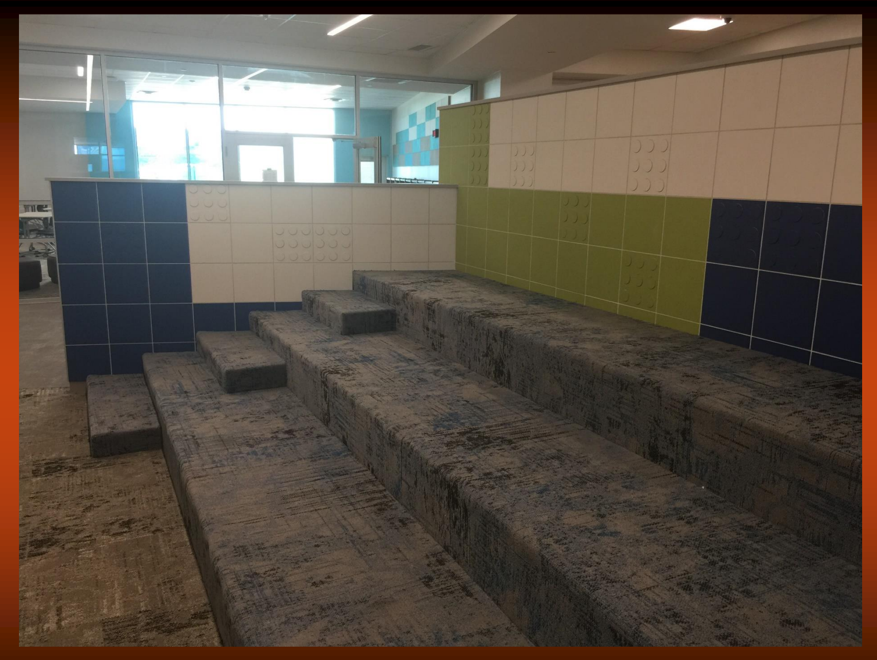
Walsh Elementary Collaboration Area