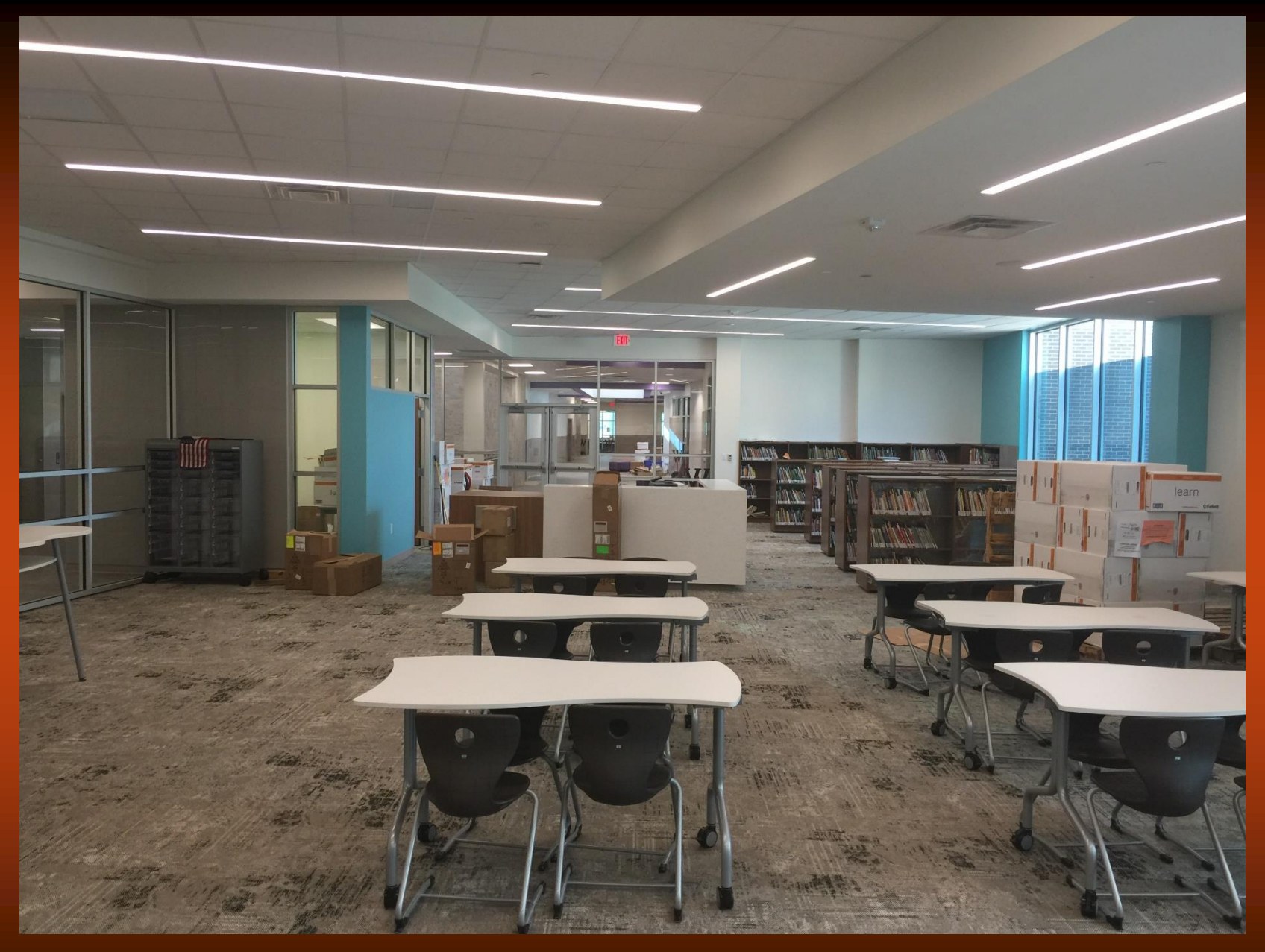
Walsh Elementary Media Center