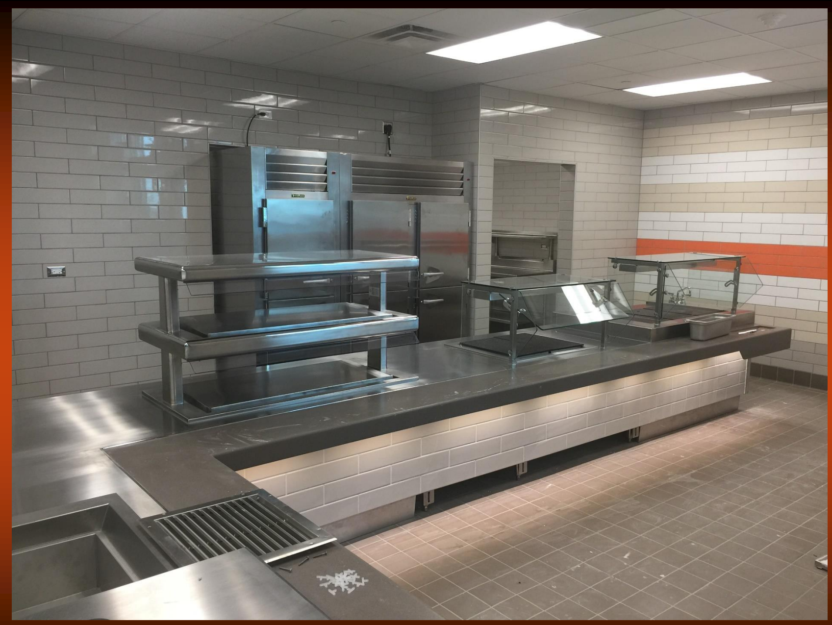
Walsh Elementary Kitchen Serving Line