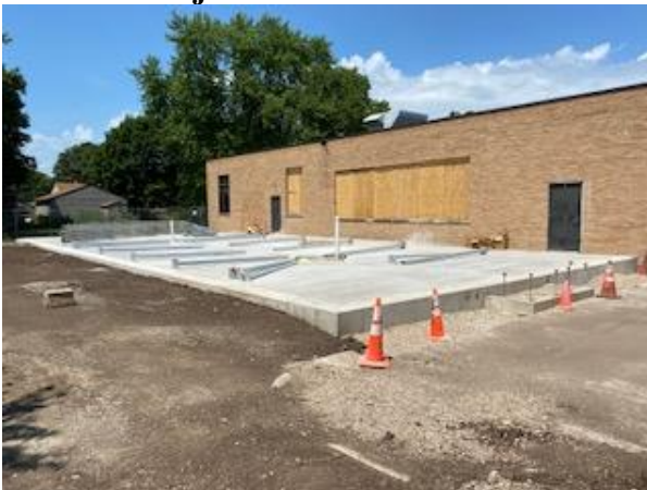
Figure 1 For the new greenhouse, the foundation and floors are poured and cured. Framing is beginning for the walls and roof.