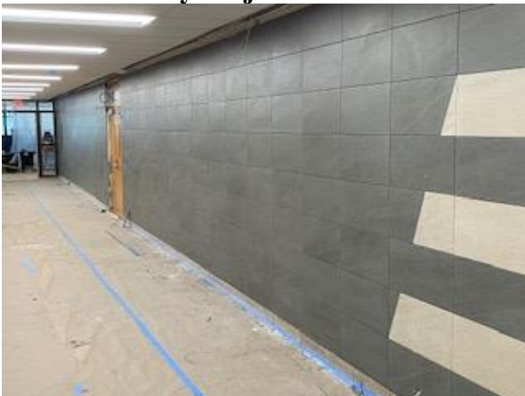
Figure 4 The wall across from the office in the main hallway is just about complete with only some trim work remaining.