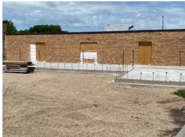
Figure 2 For the athletic training room, locker rooms, and storage, the foundation and floors are poured and cured.