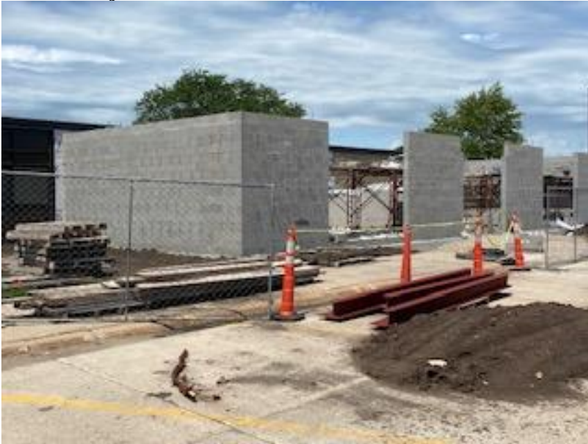
Figure 3 For the new classroom addition, the exterior walls have now been raised.