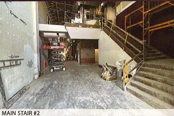
MAIN STAIR #2