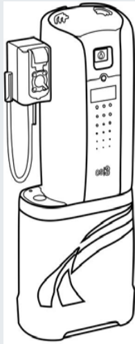
Config #1 – Generator Only Generator (AT20024)