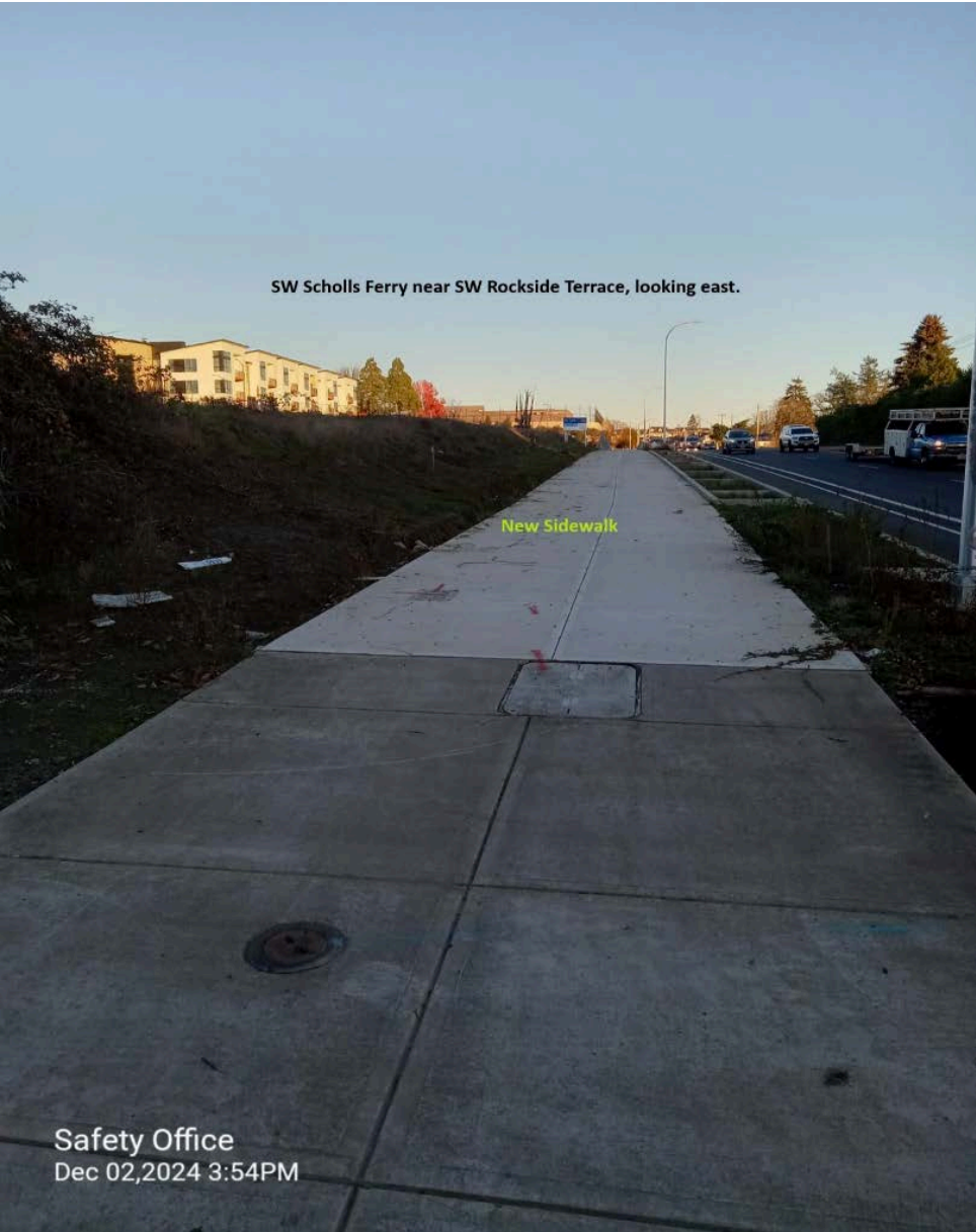
SW Scholls Ferry near SW Rockside Terrace, looking east.