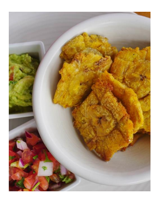
Dominican Republic: Sample Meals

Mashed plantains, rice and beans, fried/grilled fish with rice, salad, rice and beans