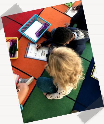
Partners in Rug Clubs