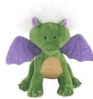
Gus - Grade Two