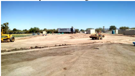
New Bus Loop Grading and Paving Prep