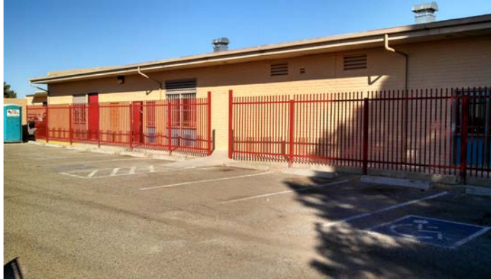
New Security Fence Installation

The Cross project is on schedule and on budget.