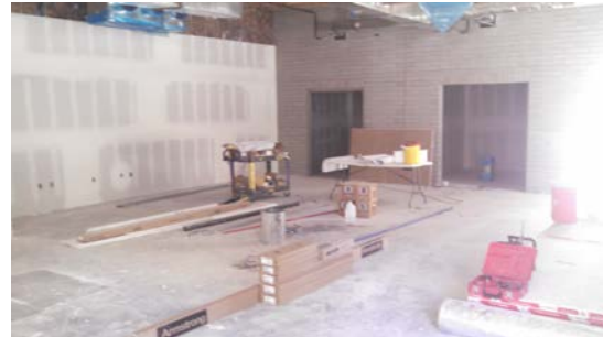
Fun House Addition (new music room)