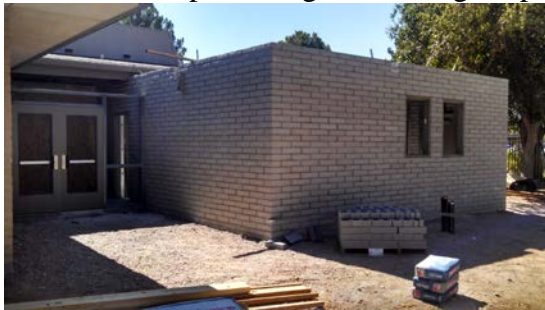
Health Office Addition and Renovation