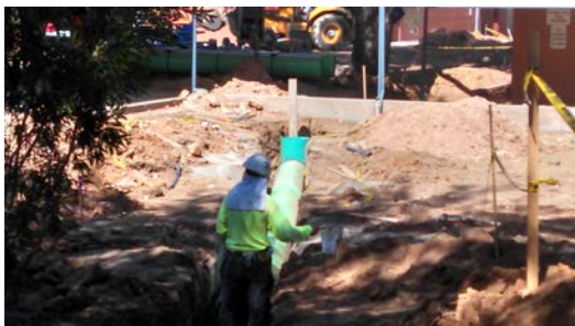
Storm Water Evacuation Improvements