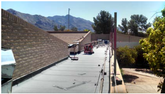
Covered Walkway Roofing Repairs