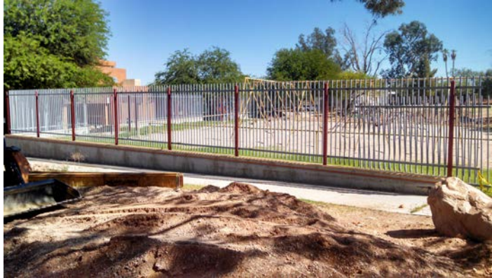
New Security Fence Installation

The Harelson Project is on schedule and on budget.