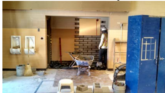
Restroom Renovations (in MPR and Admin)