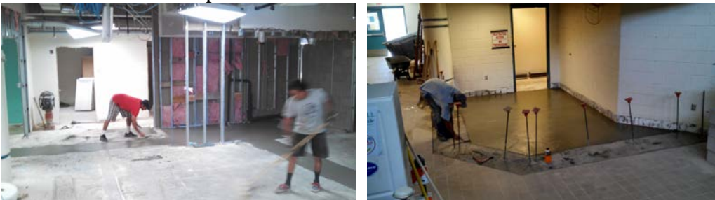
Health Office Renovation