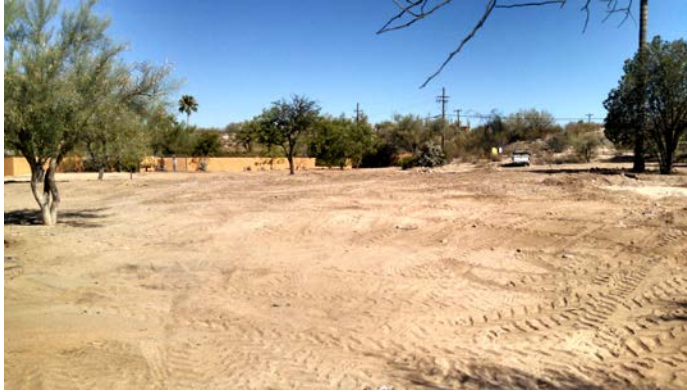
San Joaquin Site Cleared and Graded

This project is complete. Portables have been removed and the site has been cleared.