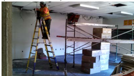
“G” Building Renovations