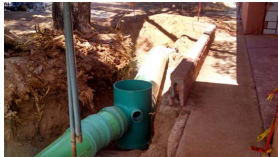
Storm Water Evacuation Improvements