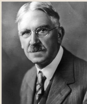
– John Dewey

If we teach today's students as we taught yesterday's, we rob them of tomorrow.