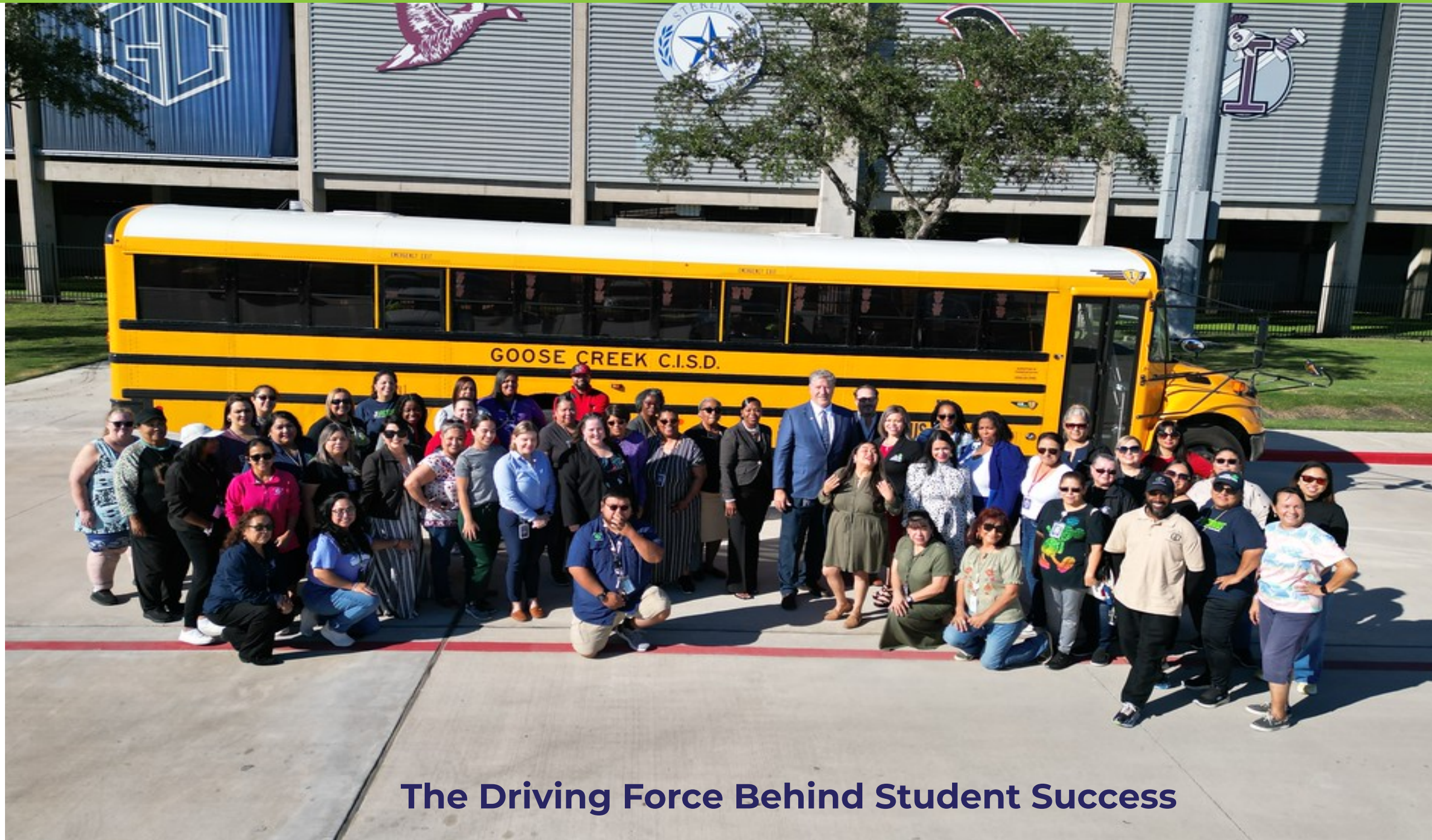
The Driving Force Behind Student Success