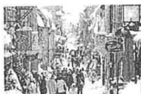
Quartier Petit Champlain

Enjoy breakfast at Restaurant Le Cochon Dingue (croissants & a bowl of hot chocolate), a small Parisian bistro with a wildly contagious and irresistible Quebecois "joie de vivre"