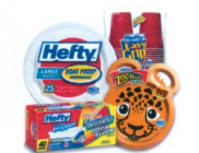
disposable tableware & waste bags