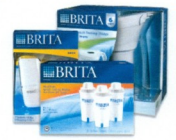
water filtration systems and filters