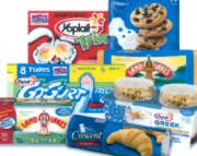
refrigerated & dairy