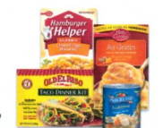
meals & sides