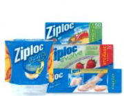
storage bags & containers