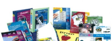
school & office supplies

Visit btfe.com/products for a complete list of participating Box Tops products