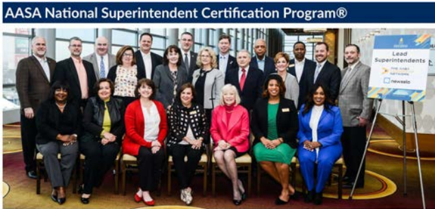
Welcome to AASA National Superintendent Certification Program®!

Browning Public Schools - All principals are working on this plan for Scenario 2 - blended learning model as we speak to ensure that when we are able we will be ready. We are requesting to come back to Scenario 1 with staff back in building with their hybrid plan by March 1, 2021 and Scenario 2 by March 18, 2021 which is the start of the 4th quarter.