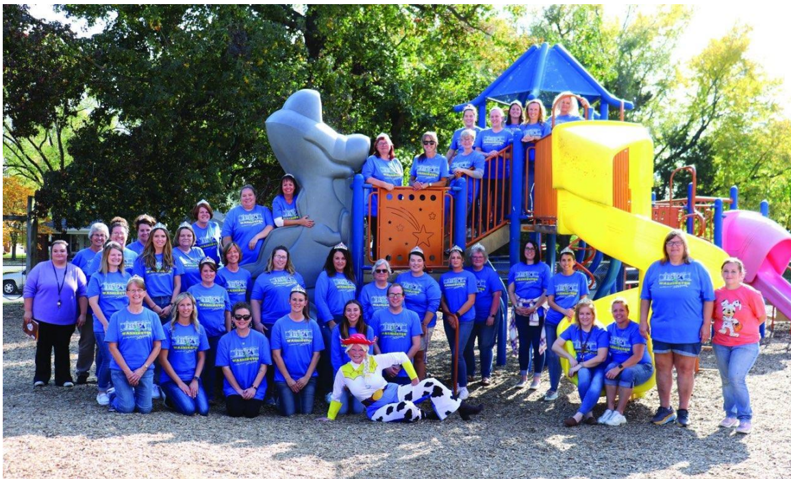
2023-2024 Washington School Staff... Simply the BEST!!!!!!