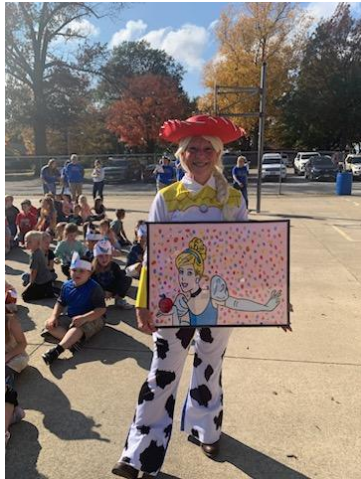
The finger prints for all of the K-2 students in Washington School.....