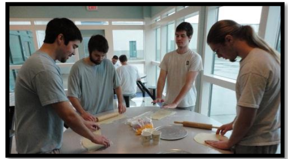
Culinary Arts Program Participants: