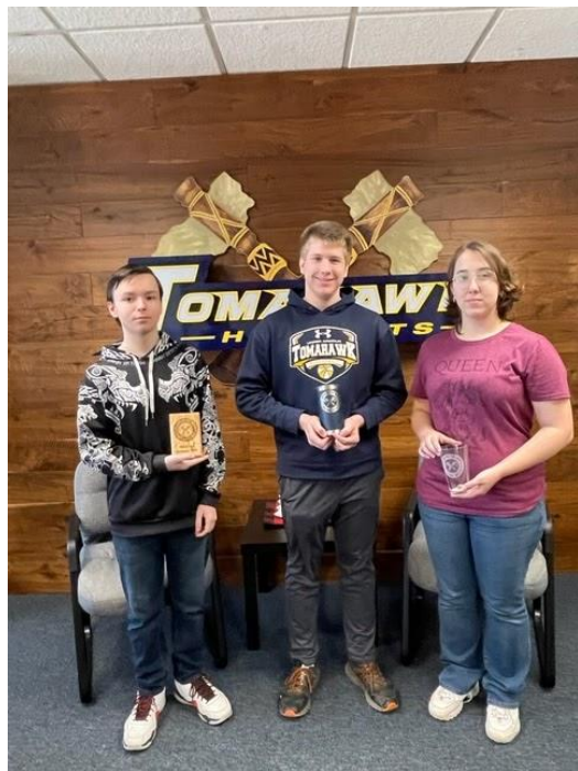
Student of the Month Awards