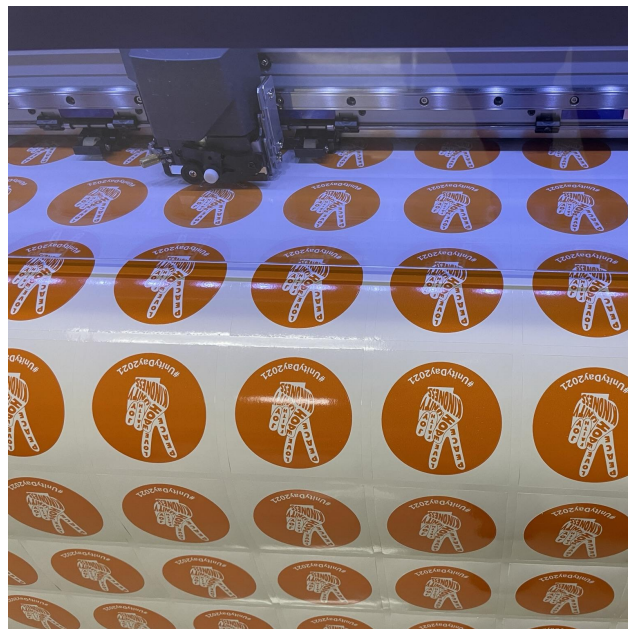
Middle School Unity Day Stickers