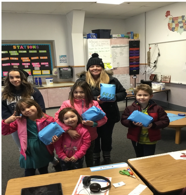
Veteran's Day Bread Delivery