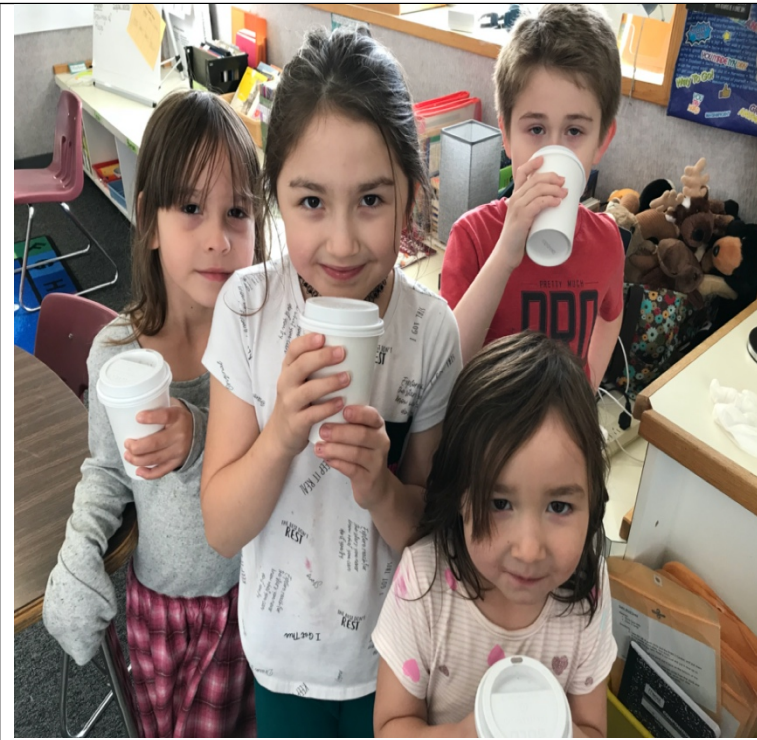
Hot Chocolate after kick sledding