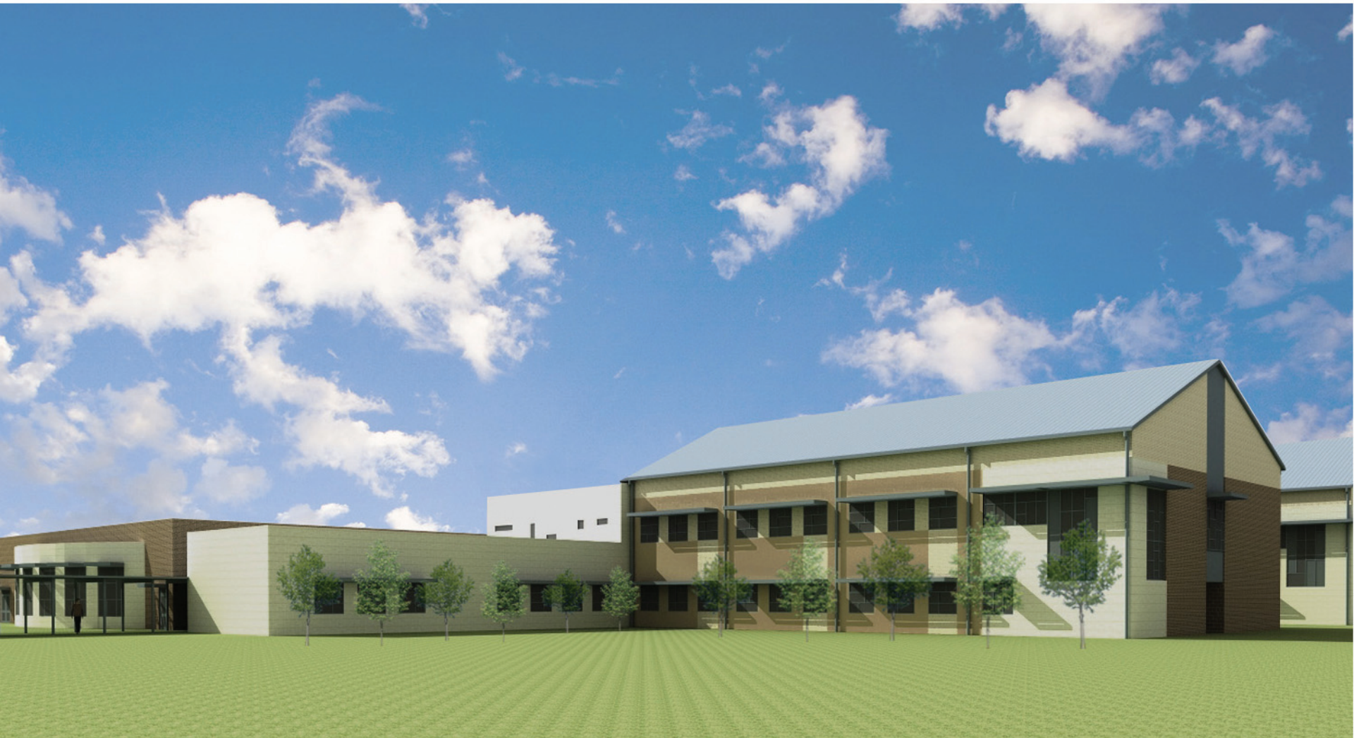
View Looking at Rear Entry_South Elevation