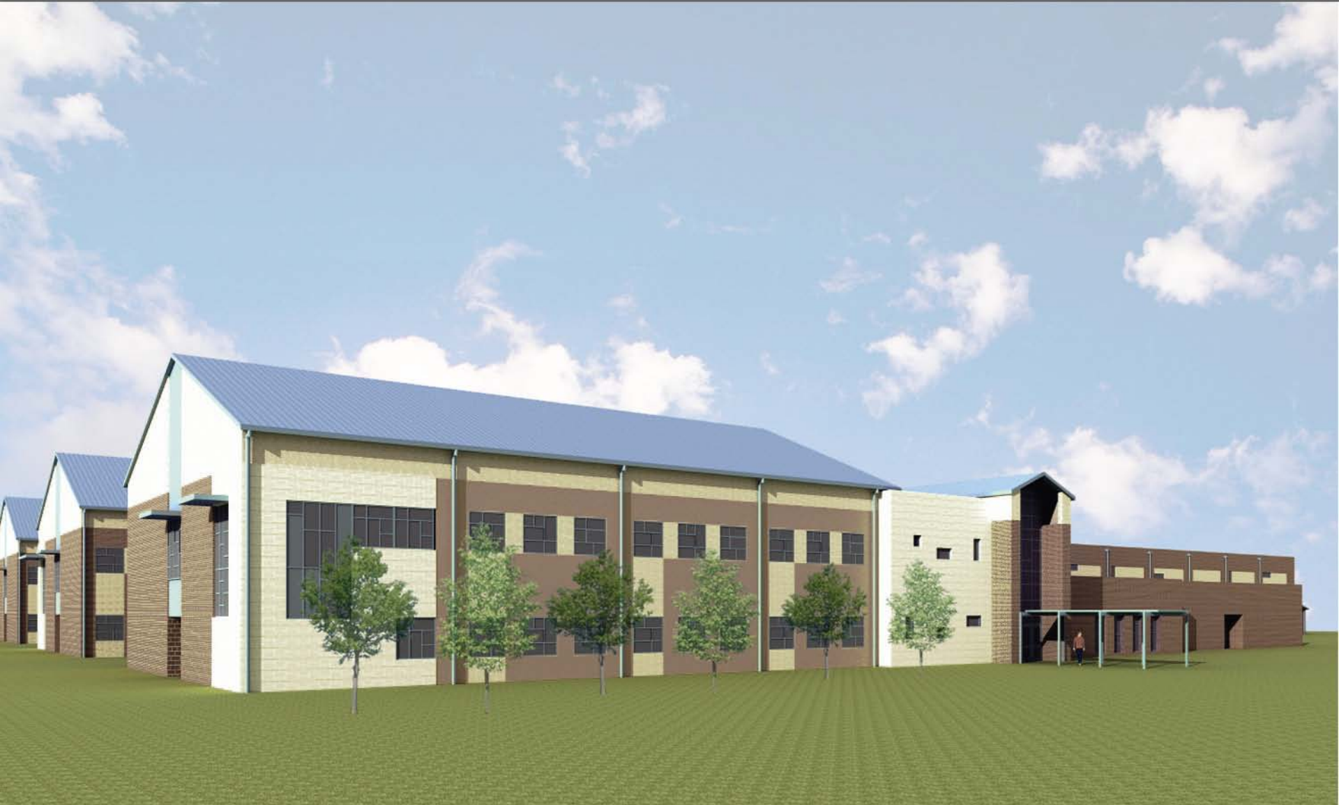
View Looking at Main Entry_North Elevation