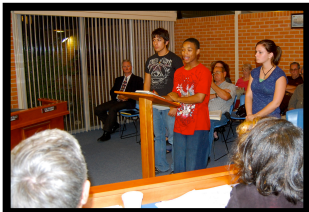
Upstarts at City Council

"I believe this program helps kids with grades and getting them into whatever they need to be successful. It helps them work as hard as they can instead of being a nobody and dropping out and living with your parents the rest of your life. This internship was my first job ever and I have learned new and important things that you need to be a success in life."