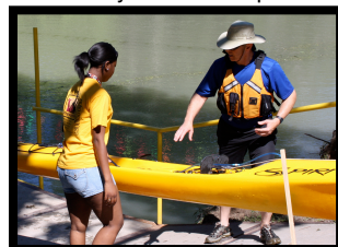
Upstarts as Community Volunteers

"Huge thanks for everything! I really appreciate it all, and hope we can make you proud of us as we work together to increase student success in many aspects. Y'all are GREAT!!!!"