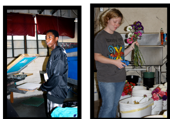
Interns at Magnolia T's & Suzanne's