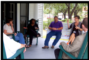
Community Focus Group

"With so many of our youth 'falling through the cracks' in our society, all of us in Luling need to be creative in implementing programs that will help prepare our young people for successful futures. The Upstarts Program is just the kind of innovative initiative that will help us begin to address this pervasive situation and allow ALL of our young people to contribute to Luling's future."