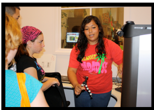
Watermelon Shop Intern