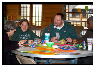
Luling Math/Science Teacher Training

"Upstarts helps kids get a look into life that most people have to wait for. It helps you think how it's going to be in the big world and helps you meet people you would never know otherwise. When you know people where you live you really get a head start in life!"