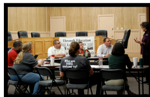
Luling Business Panel with Teachers

"This was one of the two best workshops that I have attended in 23 years of teaching. Your vision and presentation takes us back to the reason for education: to make a difference with kids and to perpetuate a society of good citizens! You guys do really good work! "