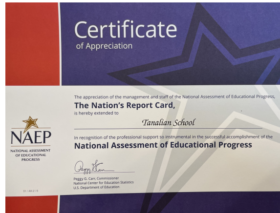
Left: Tanalian Youth Basketball scrimmage at half-time during the recent varsity tournament || Right: Tanalian's NAEP certificate of appreciation