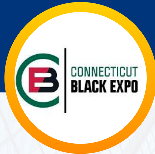
CT Black Expo