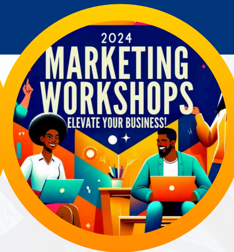
Marketing Workshop Series