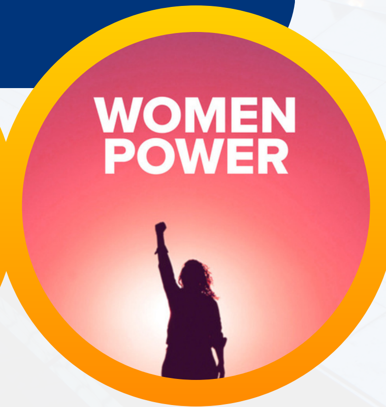
Women In Power Career Panel