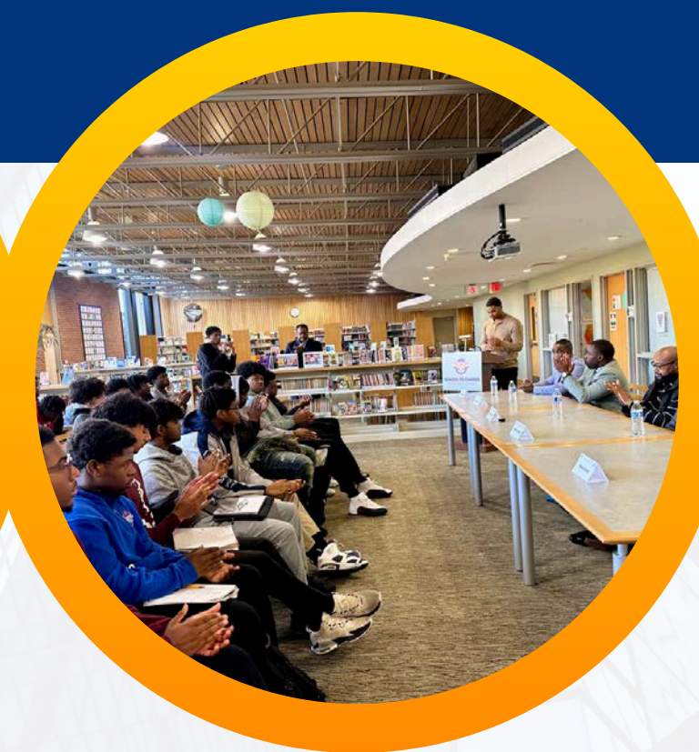
Men of Excellence Career Panel