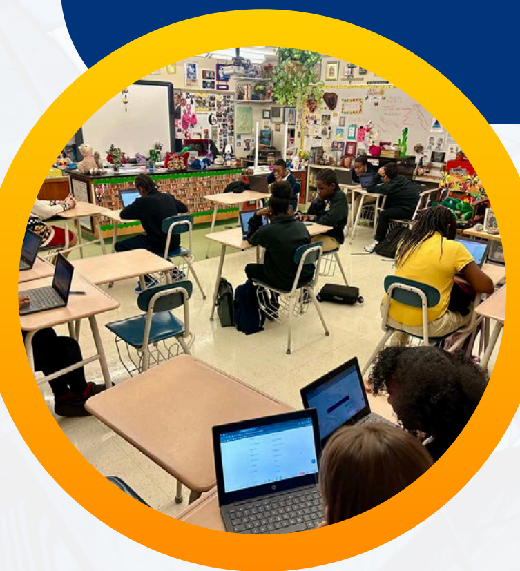
Naviance Aptitude Interest Inventory