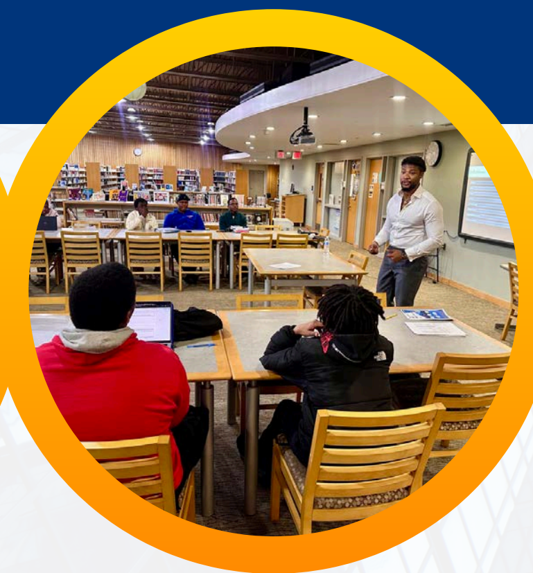
Financial Literacy Workshop Series