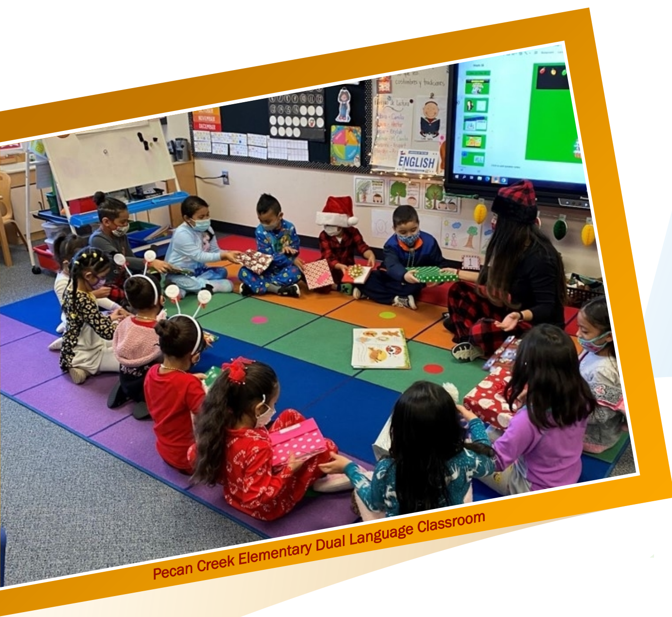
Pecan Creek Elementary Dual Language Classroom