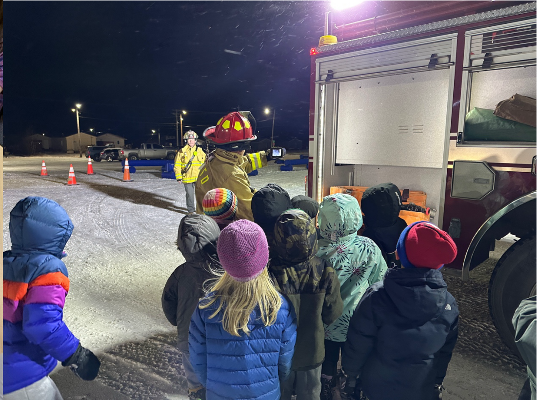
Kindergarteners looking at a special camera that lets firefighters see people through smoke and fire.