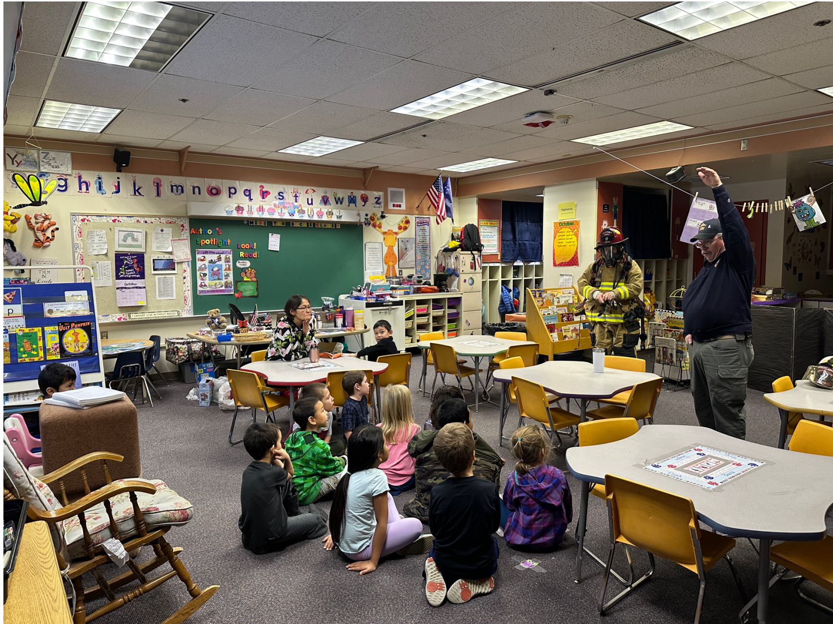
Firefighters explaining their equipment to kindergarteners