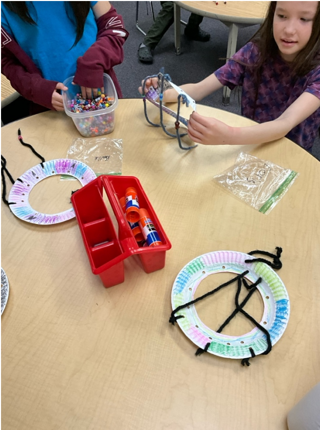
Students working on Dreamcatchers in Cultural Studies.