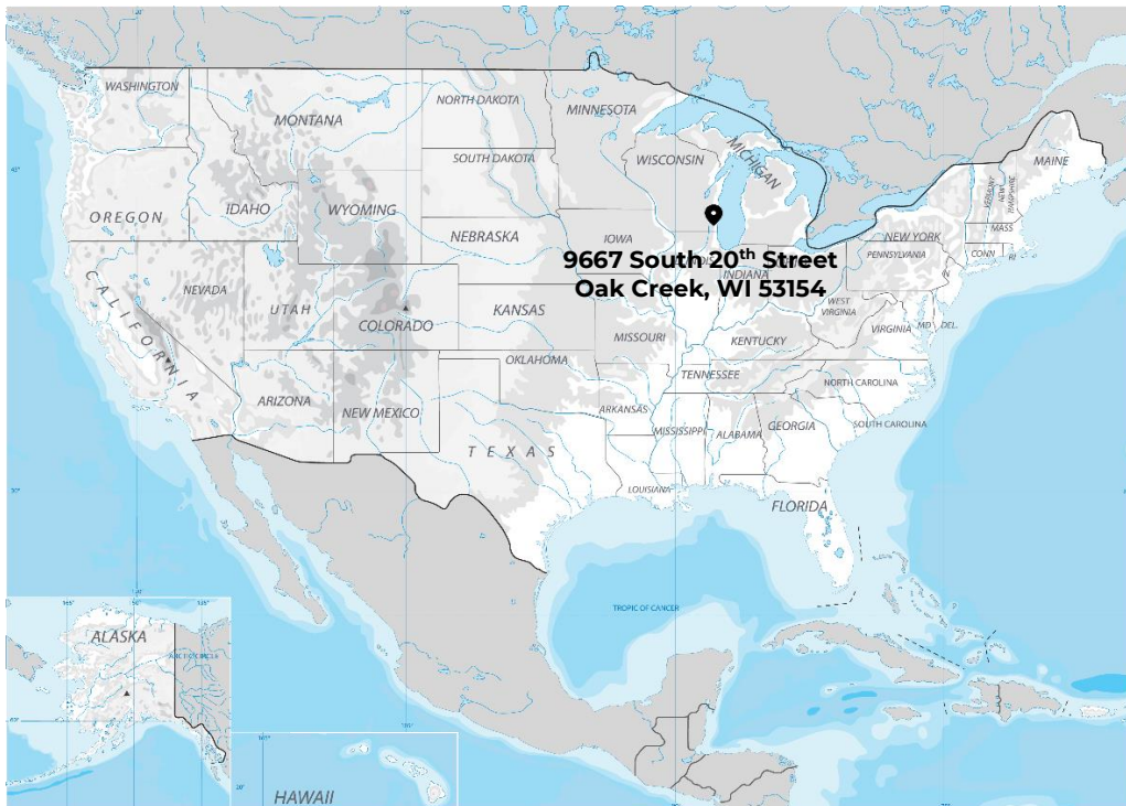
▲ SU's corporate headquarters, located in Oak Creek, Wisconsin (a suburb of Milwaukee, WI)

Specialty Underwriters LLC, a subsidiary of SU Group LLC, was established in Wisconsin on July 21, 1982. Expanding over time, the company pioneered the comprehensive equipment maintenance management program (EMMP) concept as a flexible alternative to full cost service contracts. Today SU and its affiliates serve various corporations, governmental bodies, educational institutions, medical facilities, high technology industries and other organizations worldwide!