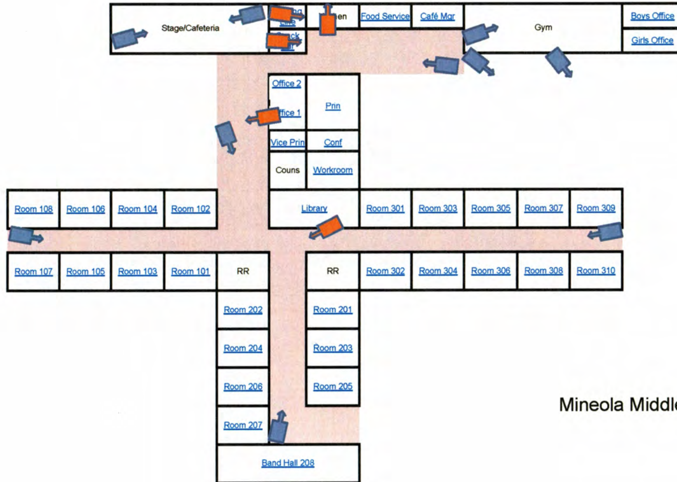
Mineola Middle School