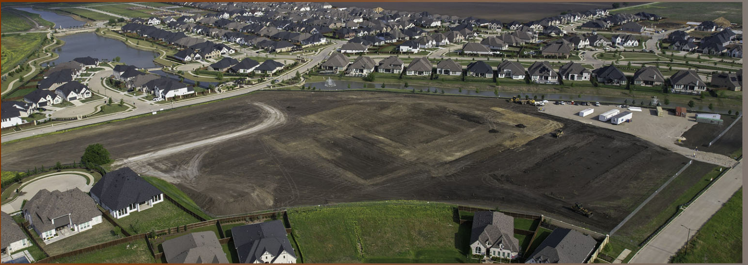
SITE LOOKING NORTHWEST TOWARDS COVENTRY DRIVE