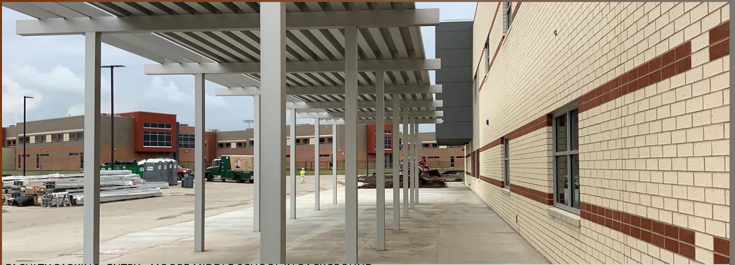
FACULTY PARKING - ENTRY - MOORE MIDDLE SCHOOL IN BACKGROUND