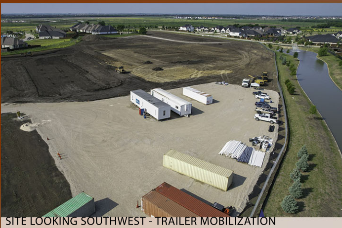
SITE LOOKING SOUTHWEST - TRAILER MOBILIZATION