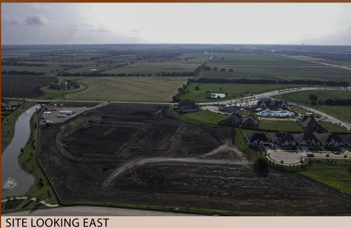
SITE LOOKING EAST