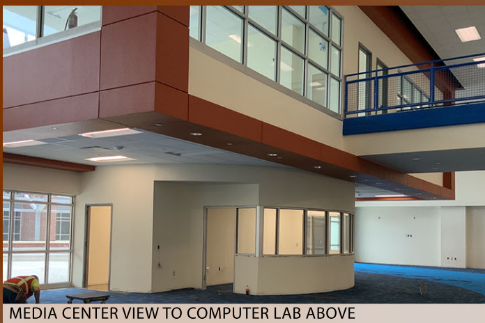
MEDIA CENTER VIEW TO COMPUTER LAB ABOVE