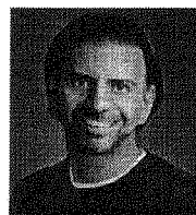
Jaime Casap Education Evangelist Google