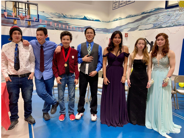
LPSD District Wide Student Government