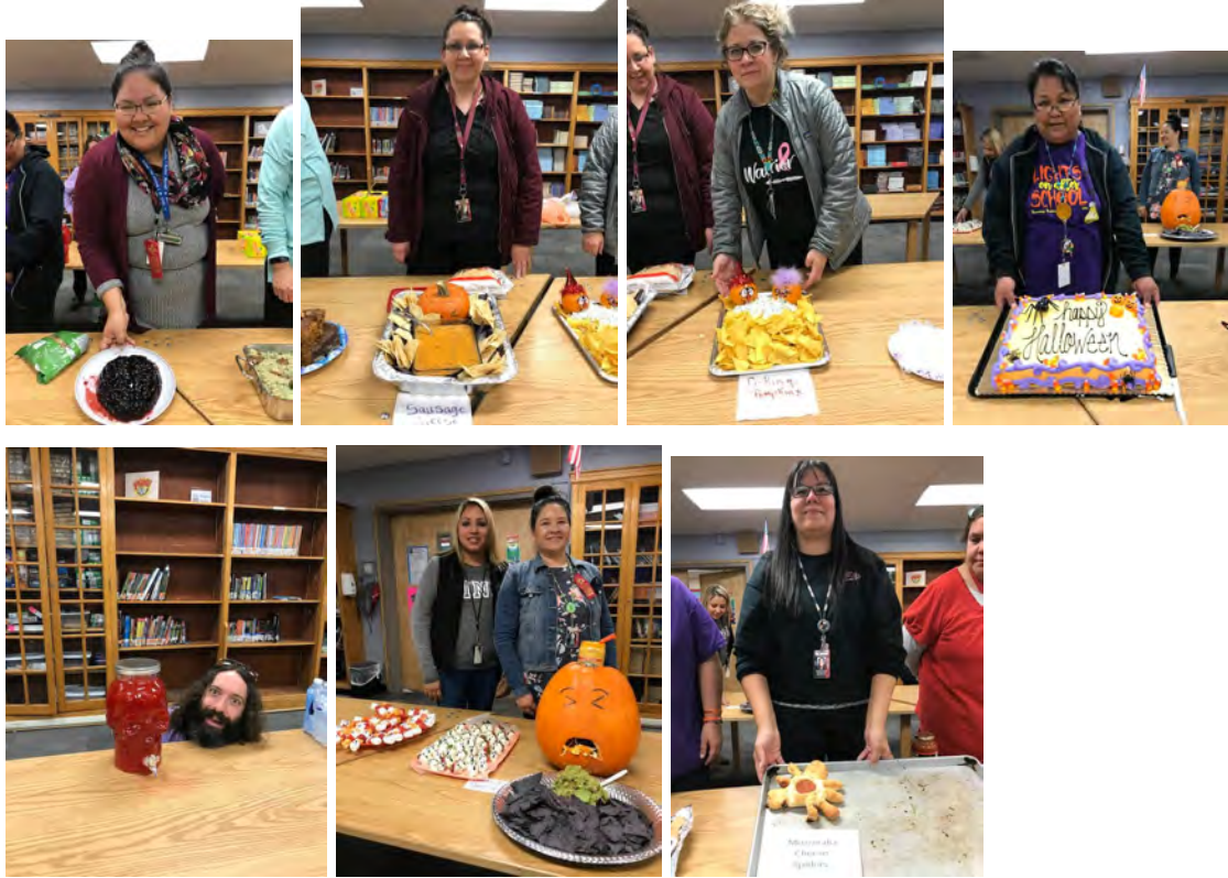
Pictures of family literacy night at Napi. We had a haunted house, blackfeet scary stories, gave out books, and ate red hot dogs.