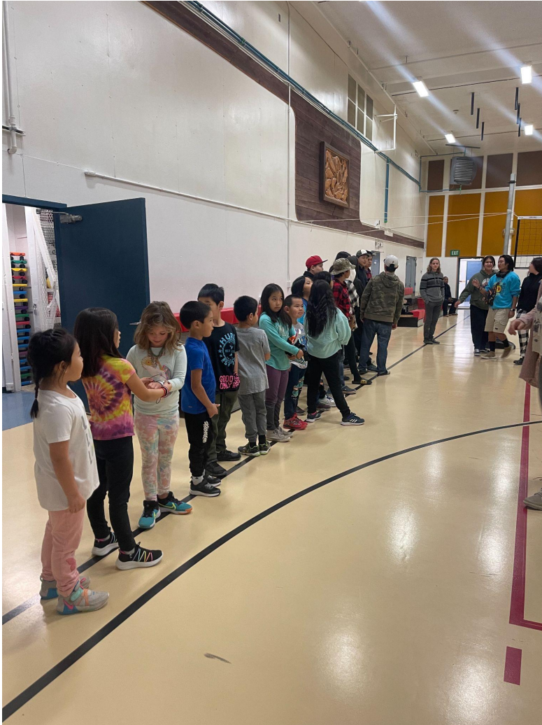
Morning activities. Learning to sort by height.