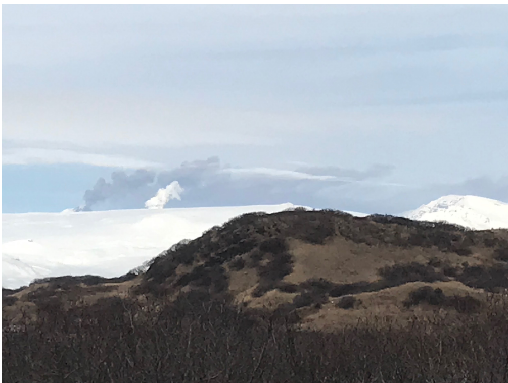
Veniaminof during the day