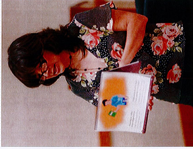
How to Deal w/Difficult Teenagers