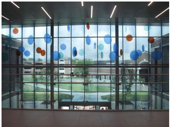
Art Fixtures Displayed in Atrium