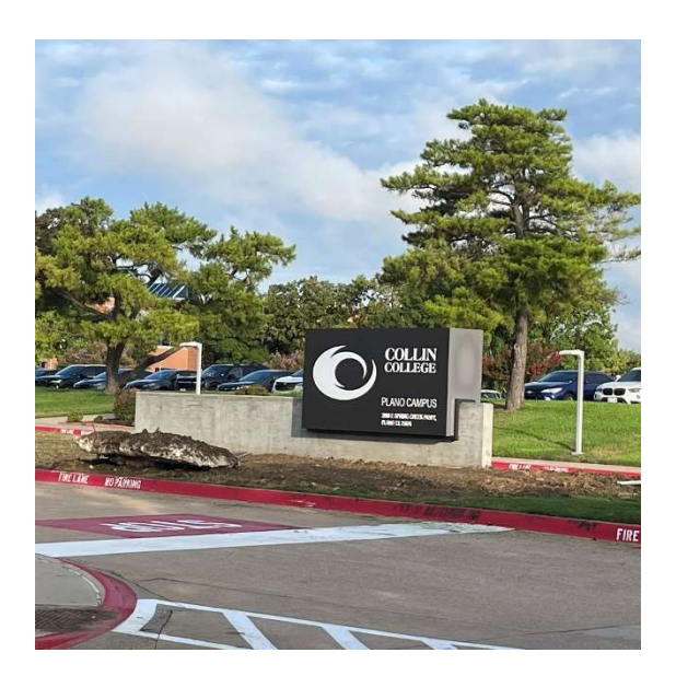
Main Campus Entrance Sign