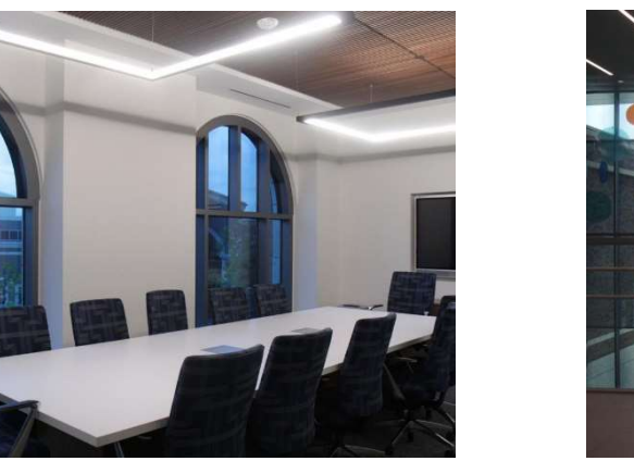
Conference Room on 2<sup>nd</sup> Floor