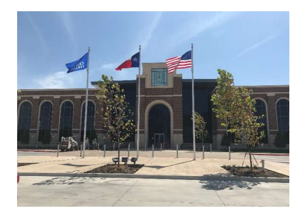
Front View of Welcome Center