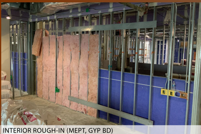
INTERIOR ROUGH-IN (MEPT, GYP BD)