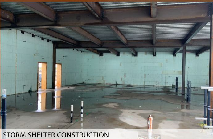
STORM SHELTER CONSTRUCTION