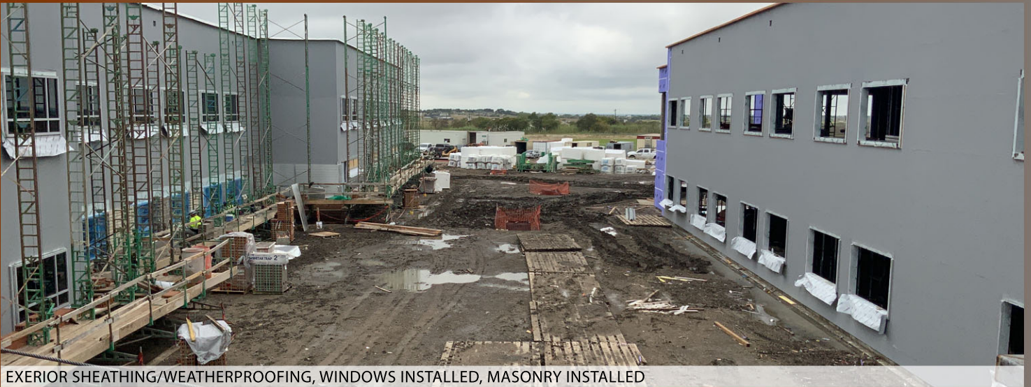
EXTERIOR SHEATHING/WEATHERPROOFING, WINDOWS INSTALLED, MASONRY INSTALLED